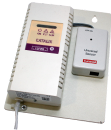
Natural Gas detector

Some simple aids and equipment that can help those living with dementia, and those who are particularly vulnerable, stay safe and happy at home.