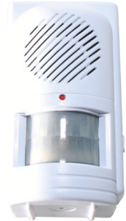
Property Exit Sensor, PIR

This will alert both the customer and the CSC* to dangerous levels of gas, preventing explosions which can be life threatening to both customers and neighbours.